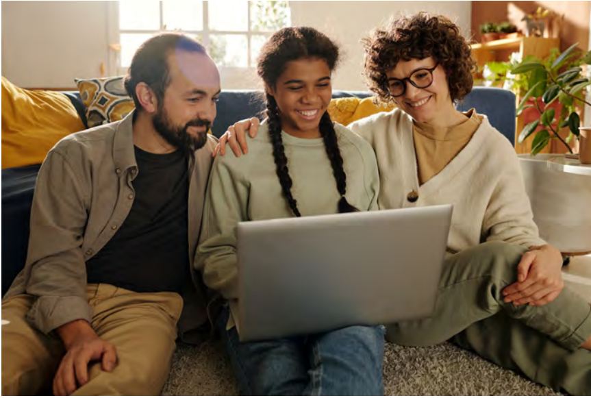
Today, families still enjoy watching or reading The Princess Bride together.

H ere's something rare in Hollywood: a movie that's as amazing as the book it came from. William Goldman wrote The Princess Bride in 1973. It had fans, but it wasn't exactly setting the world on fire. Then, Rob Reiner directed the movie version in 1987. As the movie gained in popularity, people began to read—and reread—the story book original.