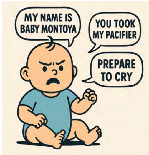
This meme is a play on Inigo Montoya's quote, "My name is Inigo Montoya. You killed my father. Prepare to die."

Inigo Montoya is a swordsman. He has been hunting for the six-fingered man who murdered his father. When he finally corners Count Rugen, he says these words with deadly calm. The line is so over-the-top that it became hilarious. Now people say it when they're pretending to be tough.