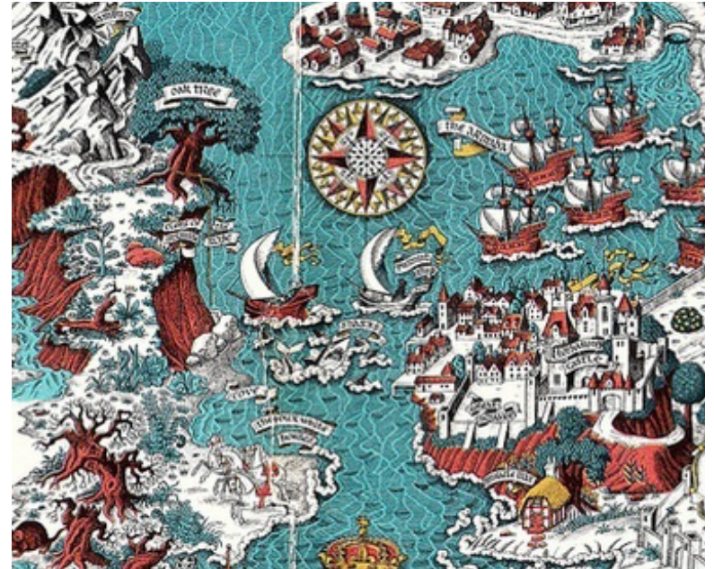
In The Princess Bride , an unlikely hero must face many challenges in order to rescue a princess.

The man in black turns out to be Westley. He has secretly taken over the Dread Pirate Roberts identity. Buttercup and