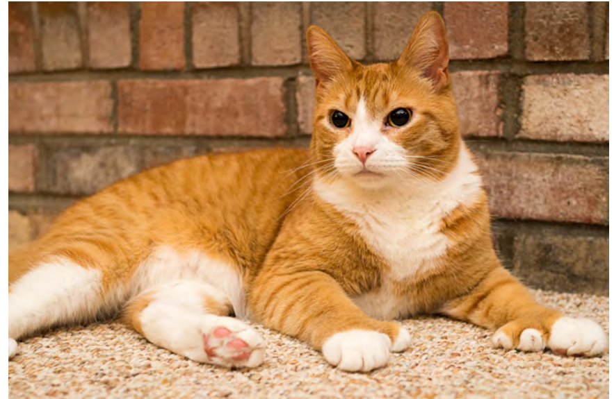
This is a polydactyl cat. One of its front paws has six toes while most cats have five toes.

Count Rugen's extra finger is not just an invention of the author. It is a real condition called polydactyly. The word